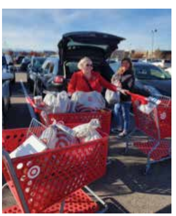
The first of many shopping trips

genuine kind words of hope, thanks and gratitude for service – not just of the military member, but for their family members as well. They say pictures speak a thousand words, so here you go –