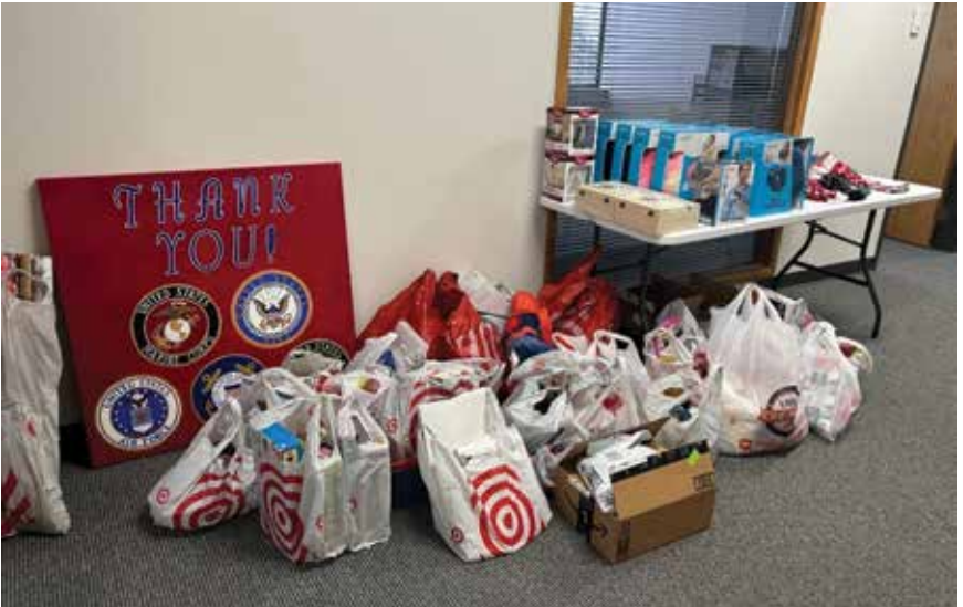
National HQ staff deliver gifts and food to families of deployed soldiers at Buckley Space Force Base.