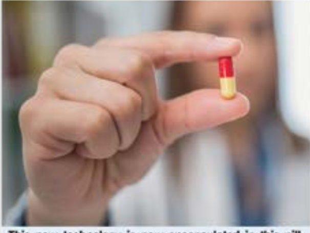
This new technology is now encapsulated in this pill. Participants in clinical studies reported improvement to joint function and comfort... in just a matter of days.