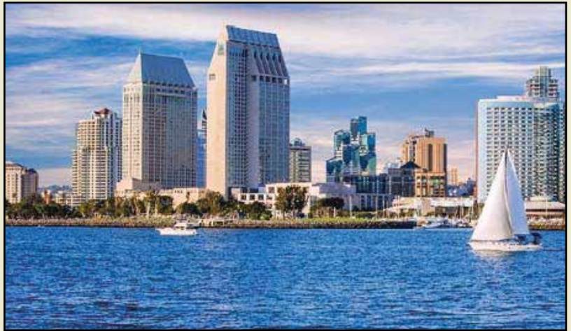
2021 ANNUAL MEMBERSHIP MEETING - San Diego, California