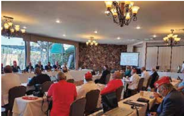
TREA Members (in person and via ZOOM), Board of Directors and Staff meet to review and discuss TREA's plans for the future.

The smell of the salt ocean air was a constant reminder that the mighty Pacific Ocean was not far away. With the pull of the ocean beckoning them in, the TREA National Board met as a whole to report to the membership the current standing, statistics and direction of TREA: The Retired Enlisted Association (dba: TREA: The Enlisted Association). This meeting was open to all TREA members and attendance was available in person as well as virtually streamed through ZOOM. While COVID certainly played a part in keeping some of our members at home, the enthusiasm and energy from those who attended was contagious and filled the void left by the empty seats of those who could not attend. We were excited to meet 5 first-time attendees who made the trek