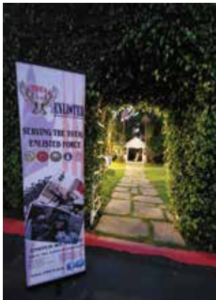
Entry into the ‘Secret Garden’ for a fabulous President’s Dinner

A special President’s Dinner was held on Thursday night in a private ‘secret garden’ alongside the beach. It was, in a simple word, magical. Delicate harp music, shadows from the table lanterns and the sounds of friendships and memories filled the cool night air. A special ‘Memory Table’ honoring the 13 heroes who fell during our exit from Afghanistan provided a profound and somber moment of reflection. For those who have never heard TAPS played from a harp – you truly are missing something special – it was stunning. The night went on to provide the perfect staging for laughter and great conversation.