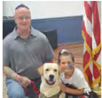
Above: TREA service dog 'Wiley' and his new veteran family at the Semper K9 service dog graduation

This, is just a small recap of 'What We Do'.