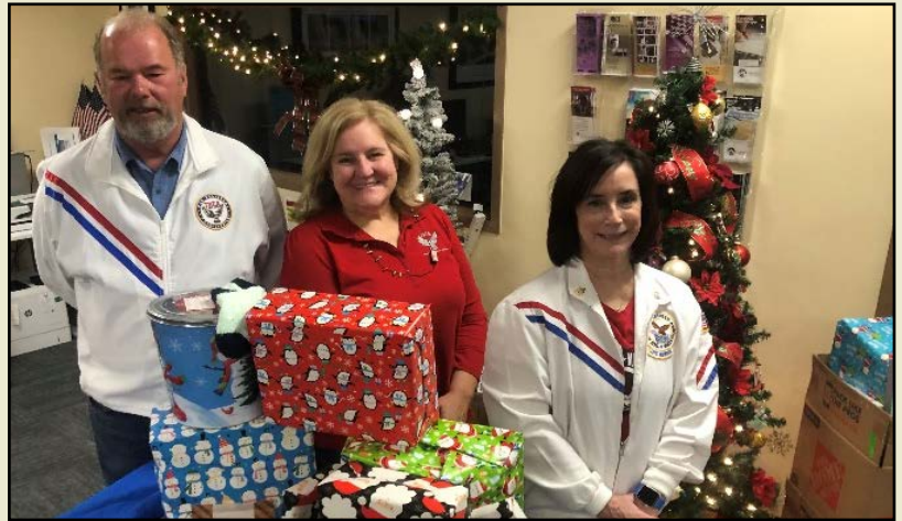
2021 HOLIDAY PROGRAM