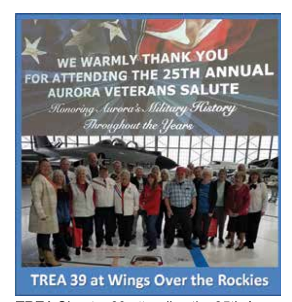
TREA Chapter 39 attending the 25th Annual Aurora Veterans Salute at Wings Over the Rockies

Chapter 39 held their Anniversary dinner on February 8th. This event was well attended by Chapter members and guests, including several local board members and HQ staff.