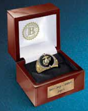
Comes in a Deluxe Wood Presentation Case with Engraved Plaque