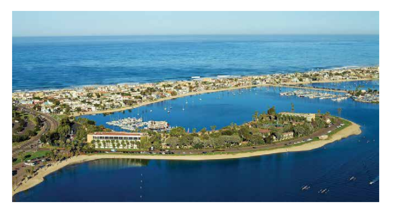
The Bahia Resort, Mission Bay - San Diego, CA September 15th – 17th, 2020

The TREA National Board of Directors will be onsite at the Bahia Resort to hold the yearly membership meeting, previously known as the 'convention'.