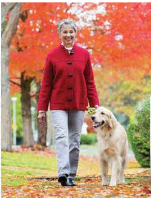
Chinese herbs provide fast relief of leg and feet tingling, burning and numbness. They do this by improving the flow of blood, nutrients and oxygen to your legs and feet to repair damaged nerves.

Now you can get a good night's sleep - peaceful, restful sleep - with no pain, tingling, zing-