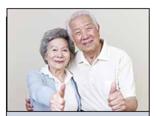
"I had so much pain from burning nerves in my feet I could barely move...but this makes it calm down so I can walk and sleep. I really love this stuff. Other pills didn't work. It stops the nerves from hurting so bad. It is amazing. Neuro-Flo lets me move and sleep pain-free. It is wonderful."

Neuropathy is like a wildfire. It starts with a small flame, but then quickly turns into a raging fire in your feet that never stops. Left alone or treated in a way that doesn't work, it can lead to constant suffering – or even one of the 86,000 Americans who need a limb amputated each year according to the National Institutes of Health.